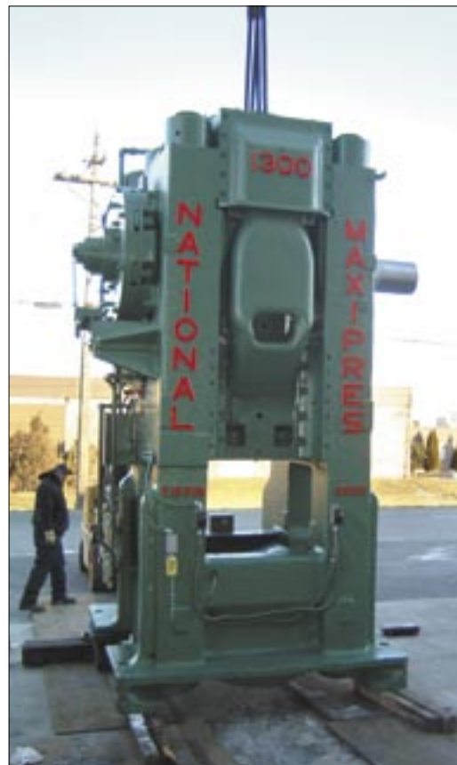
1300 ton national press rebuilt at Girotti's and being staged for transport.