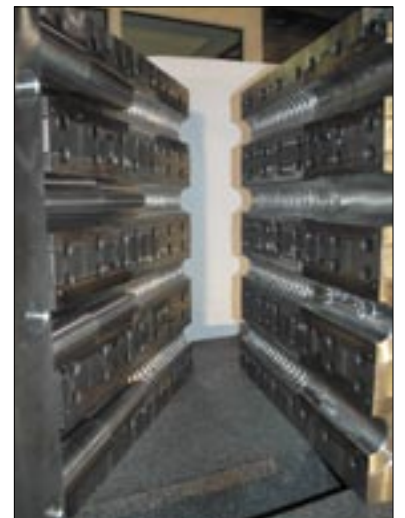
Forged tooling die set—designed, supplied and machined at Girotti's.