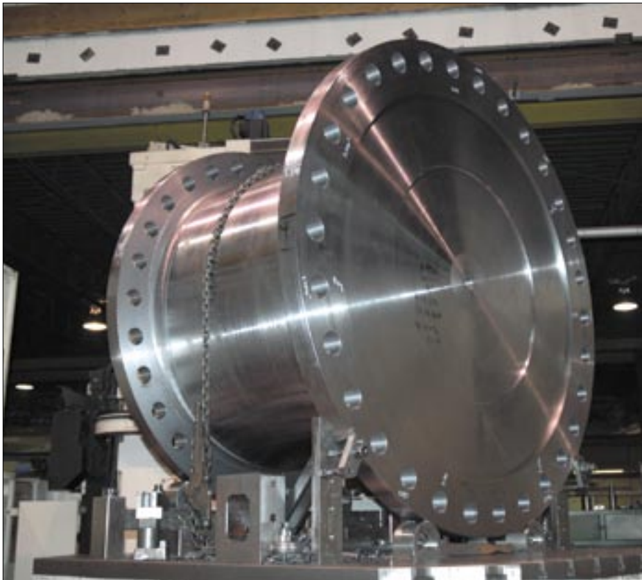
Finished machined large Steel Mill coupling drive spacer.

Girotti Machine's welding department also has many years of experience in overlay welding and is capable of welding a wide range of materials.