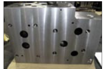
High pressure manifold for steel mill application.